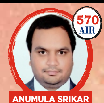
Offline GS Foundation Batch Classroom Student Hyd CSE 2018