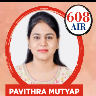
Offline GS Foundation Batch Classroom Student Hyd