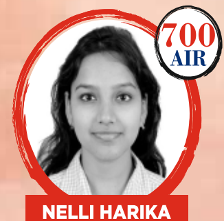
Offline GS Foundation Batch Classroom Student Hyd CSE 2020