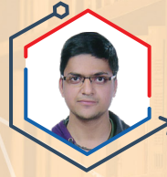
AIR 4 YASH JALUKA