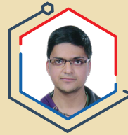
AIR 4 YASH JALUKA