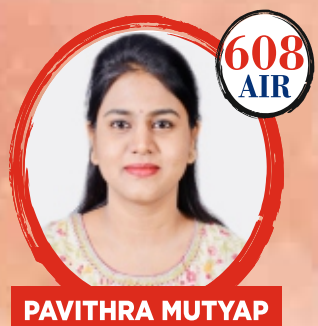
Offline GS Foundation Batch