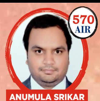
Offline GS Foundation Batch Classroom Student Hyd CSE 2018