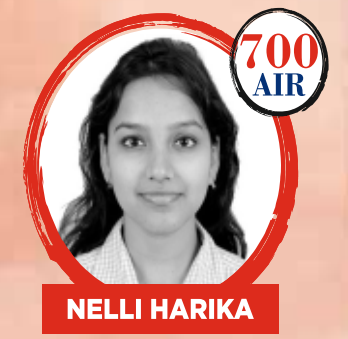
Offline GS Foundation Batch Classroom Student Hyd CSE 2020